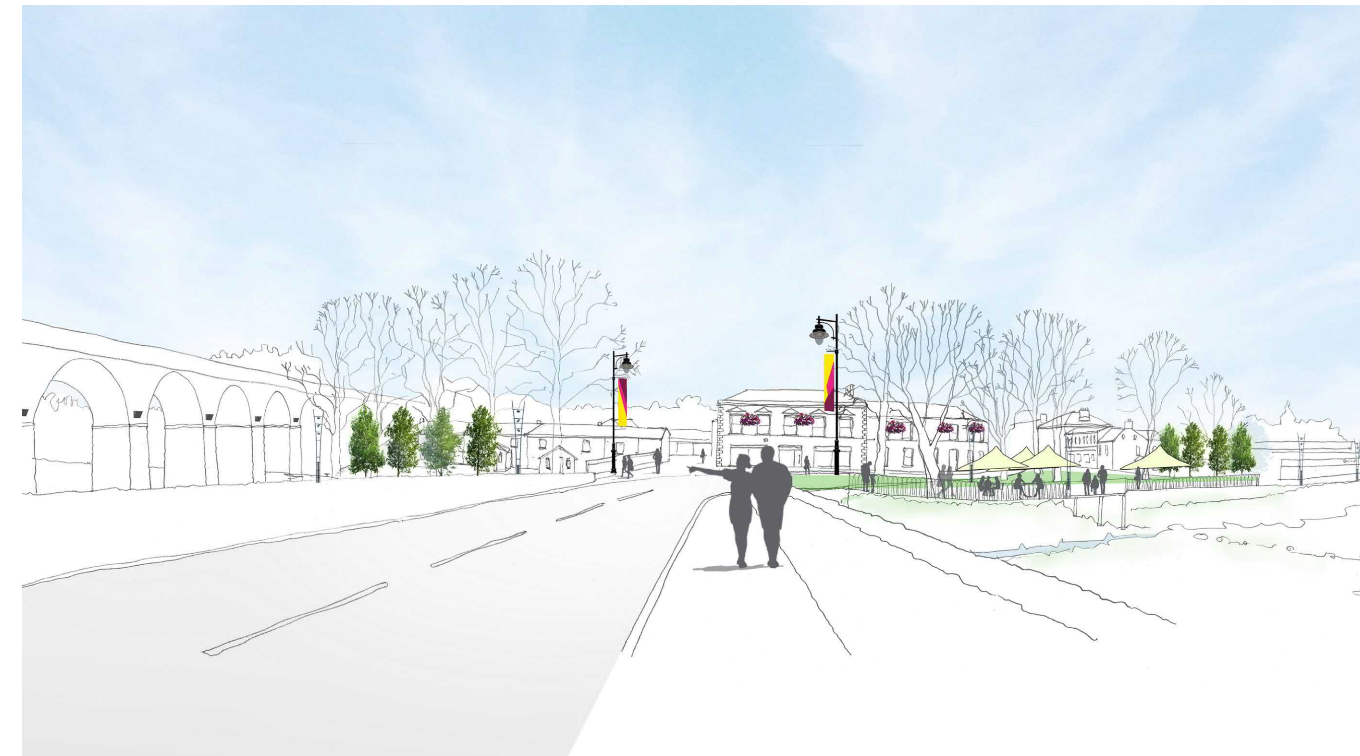
Randalstown View 2 - Viaduct