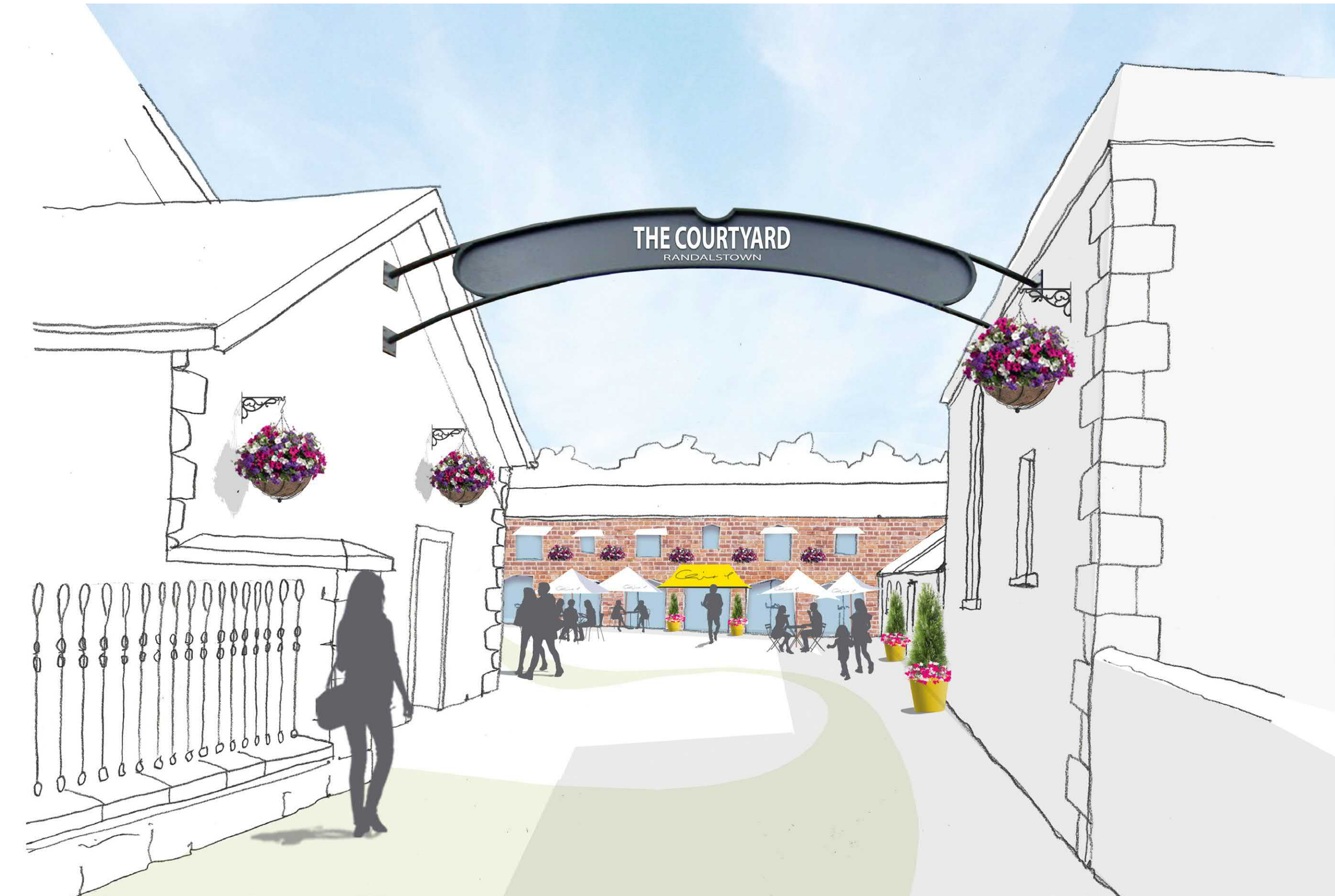
Randalstown View 1 - Courtyard