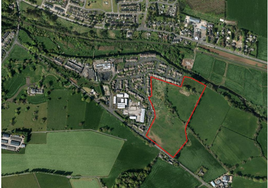
Aerial View of Subject Site