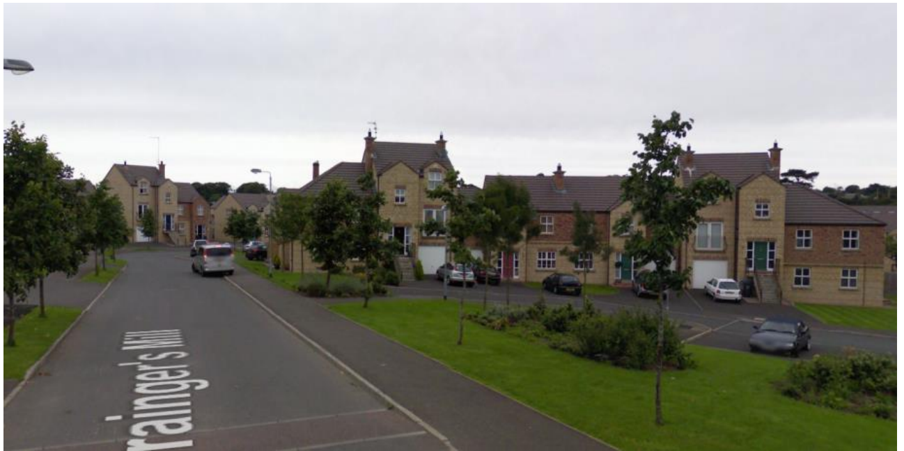
Existing Housing Development at Grainger's Mill (built by Toland House Properties Ltd)