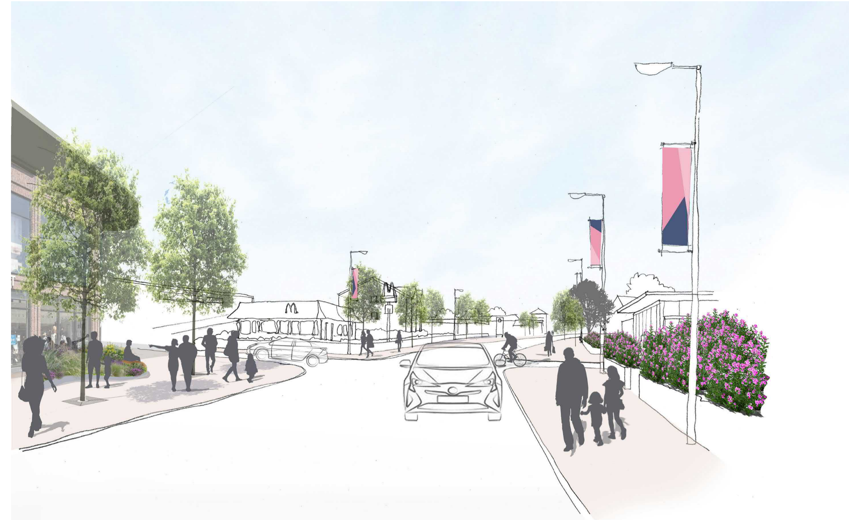
Glengormley View 1 - Antrim Road