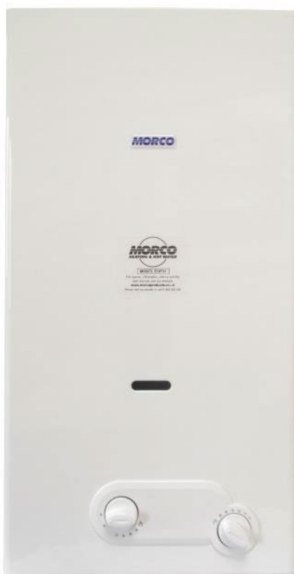
EUP 6 & EUP11