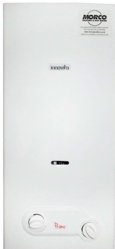
Primo 6 (MP6) & Primo 11 (MP11)