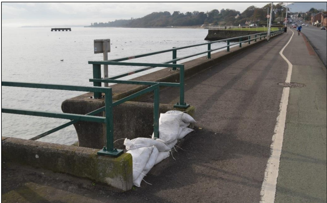
Figure 4: Sandbags on A2 Shore Road at Whiteabbey