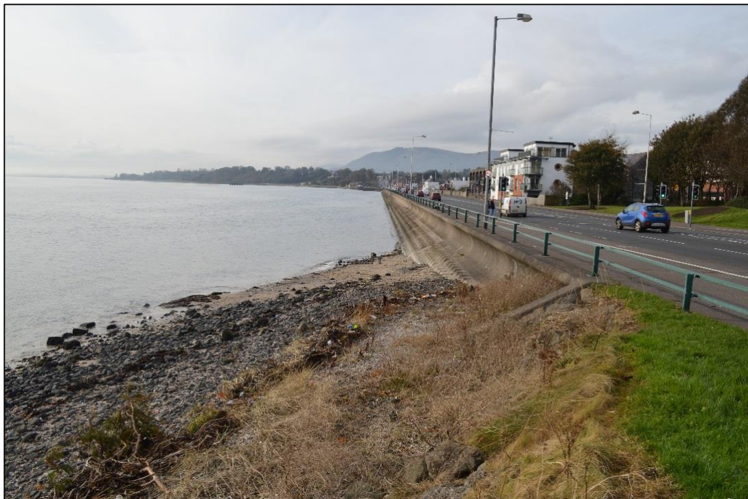
Figure 2: A2 Shore Road Whiteabbey