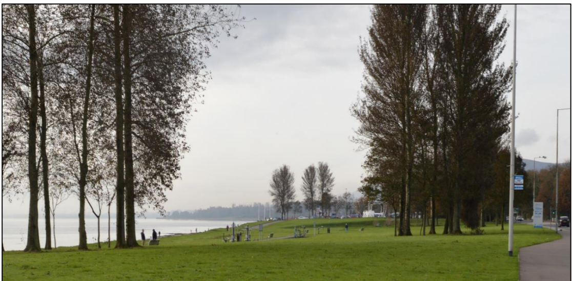
Figure 3: Jordanstown Loughshore Park