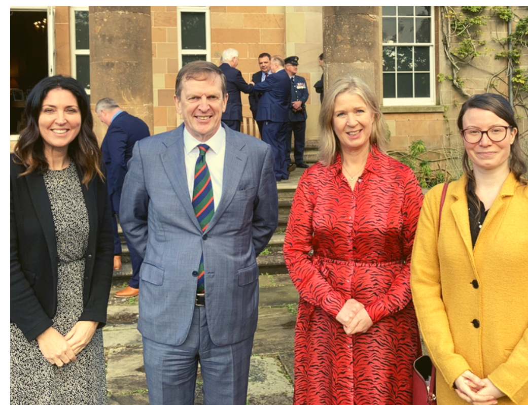
The Northern Ireland Veterans' Support Office core team: