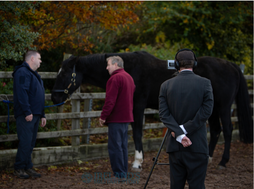
taken at Mind the Pipes and Drums rehearsal, Decorum NI & Horses for People