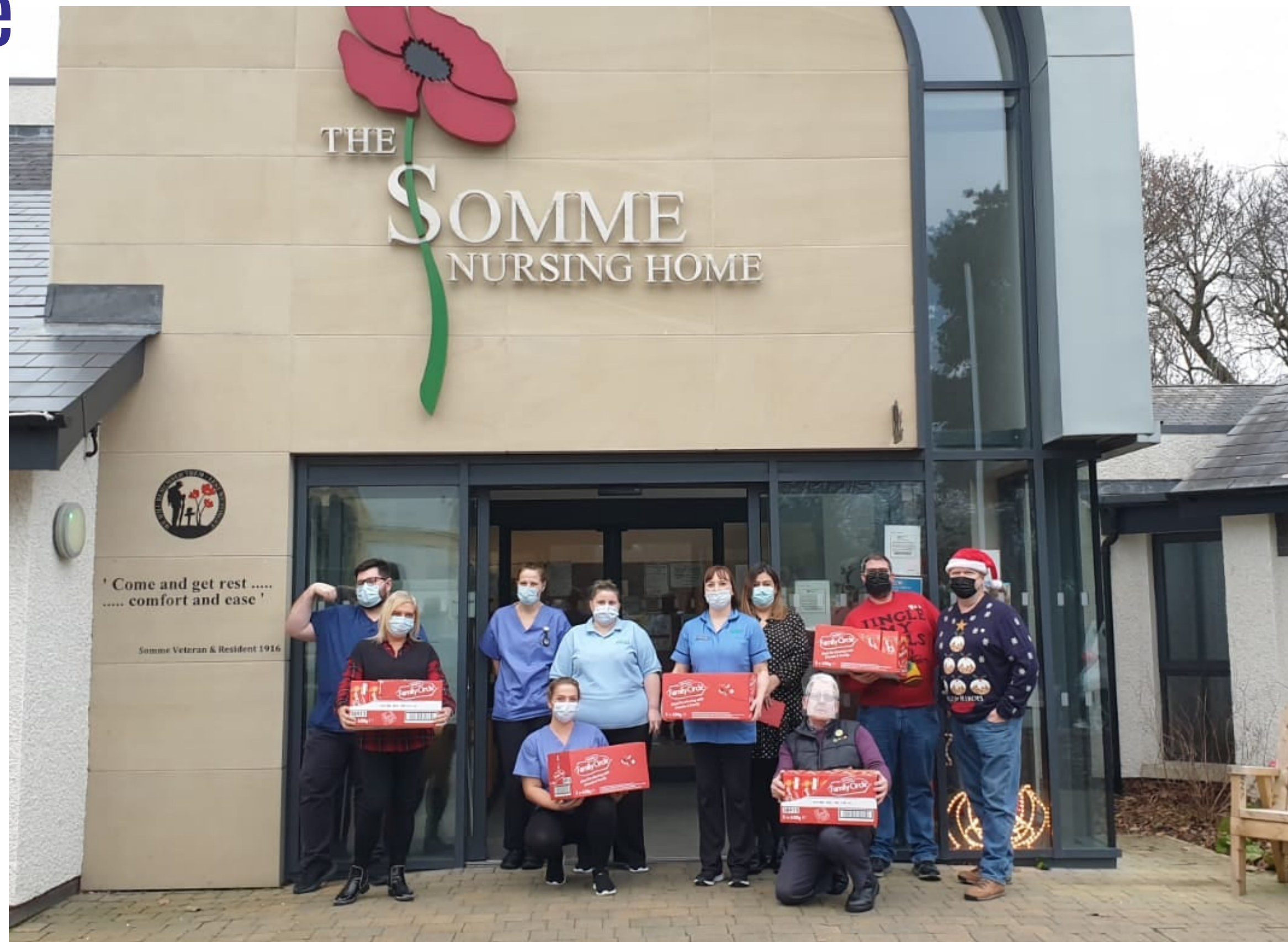
Staff at the Somme Nursing Home were on hand to greet some of the veterans behind Operation Family Circle, 16 December 2021